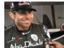
7HDP $EX ' KDELVHW IRLDFH