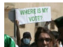
, UDQDQV IO ' XEDL SURMFMGRQD HXOV