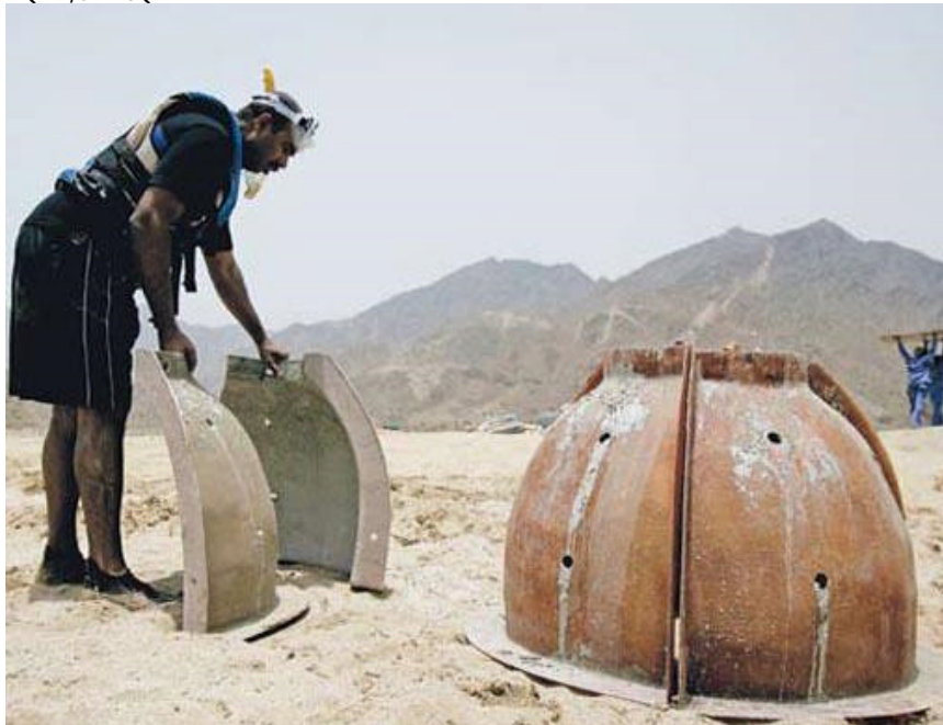
$QGUHZ &DEDQUR 5HQRQV *XO 1HZV $Q HOYLLROP HQMDZ RUNHUSXW VRJ HMKHUSHFHV RI D P RXGQ IRLDQ DUWFLDOHHI WUXFW XLH GXULQJ D GHP ROMDMRO