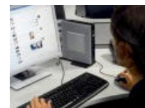
6DIH VXUQJ VMSV !! 0 RUH * 1 79 YLGR