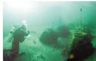
Carp condos: Artificial reefs provide more than just fun for sport divers. They also provide a safe habitat for a variety of underwater animals. (Submitted photo)

BEDFORD - To a fish swimming along on its fishy business, a massive ship hitting the ocean floor is nothing but an opportunity.