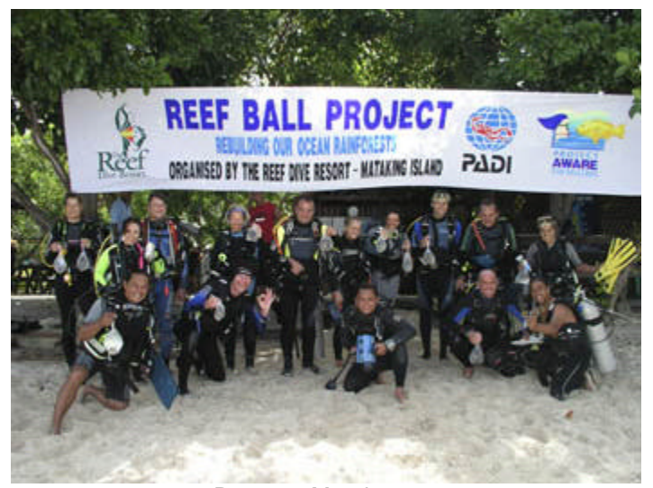
Date: 27 March 2005 Participants: 45 participants No. of deployment: 100 Species planted: Finger corals Location of reefball: House Reef & Turtle Playground