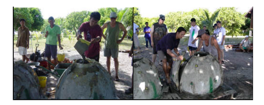
3. Deployment of the reef ball