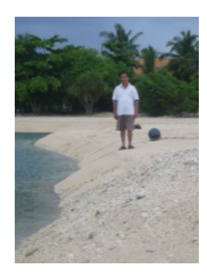
Photo showing steepness of western side of spit channel, looking north to the island.