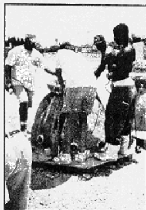
Workers preparing the molds (see our bladder in top photo) and pouring the concrete mix. Finished Reef Balls are shown in the bottom picture.