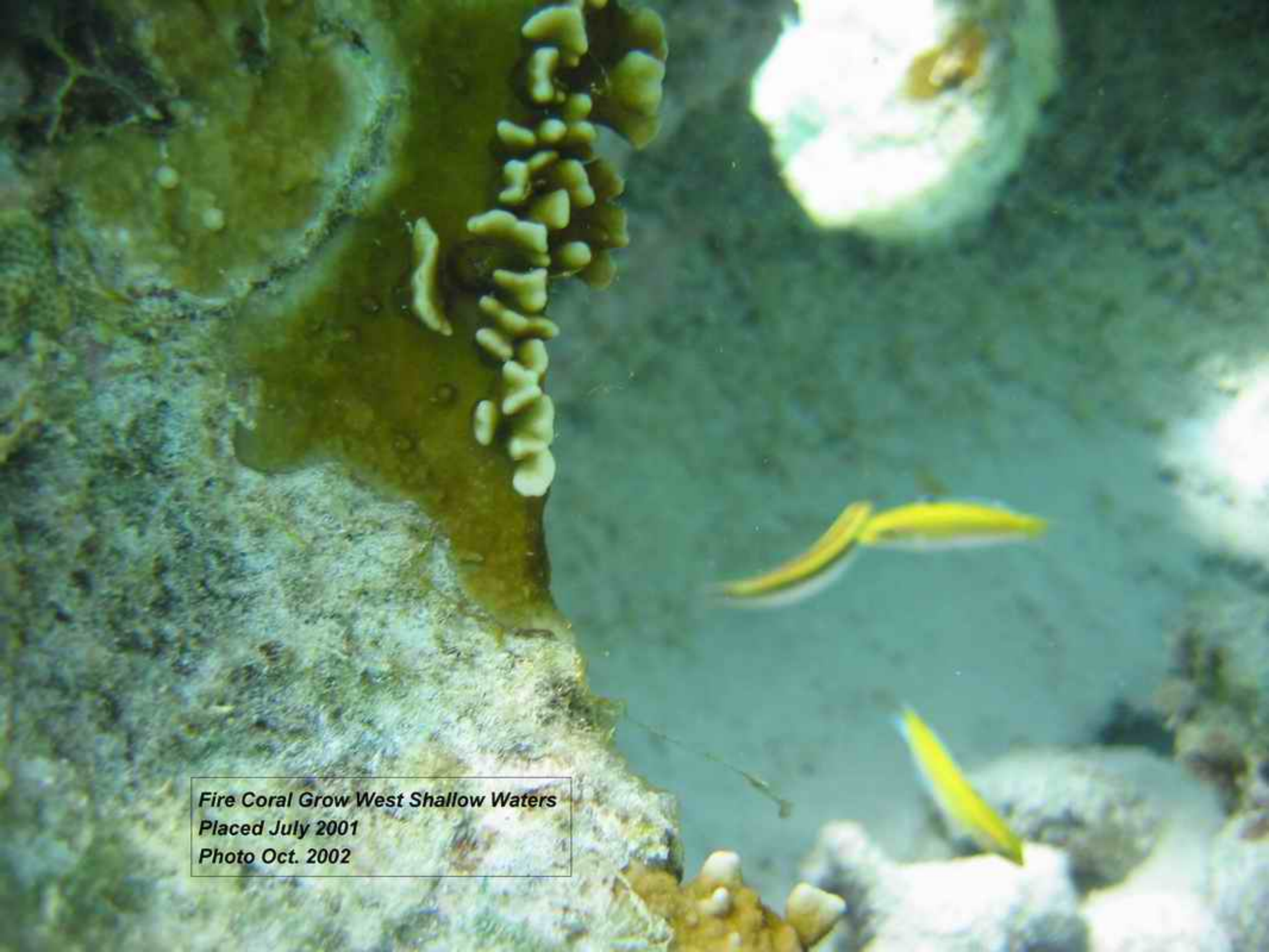
Fire Coral Grow West Shallow Waters Placed July 2001 Photo Oct. 2002