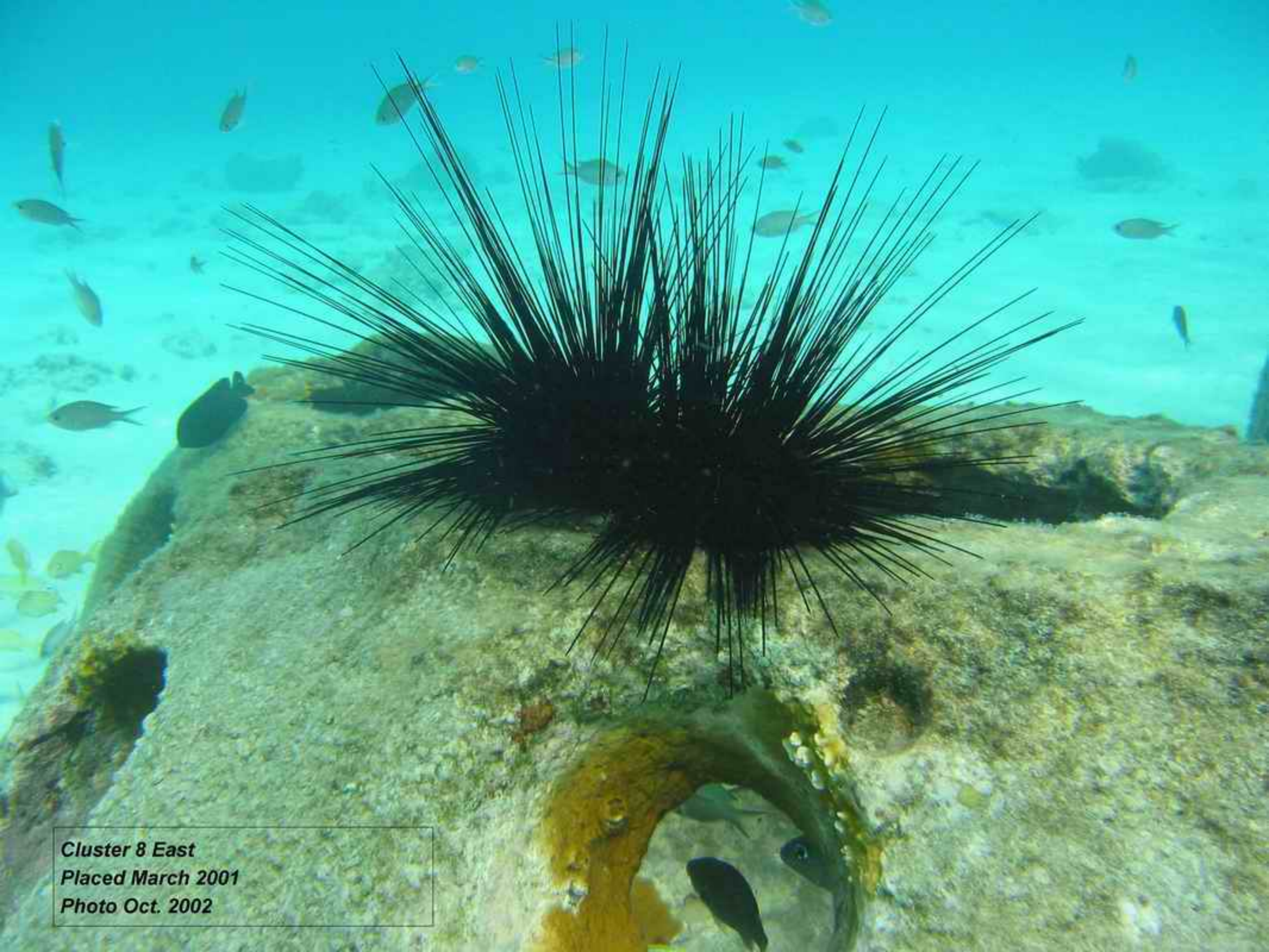
Cluster 8 East Placed March 2001 Photo Oct. 2002