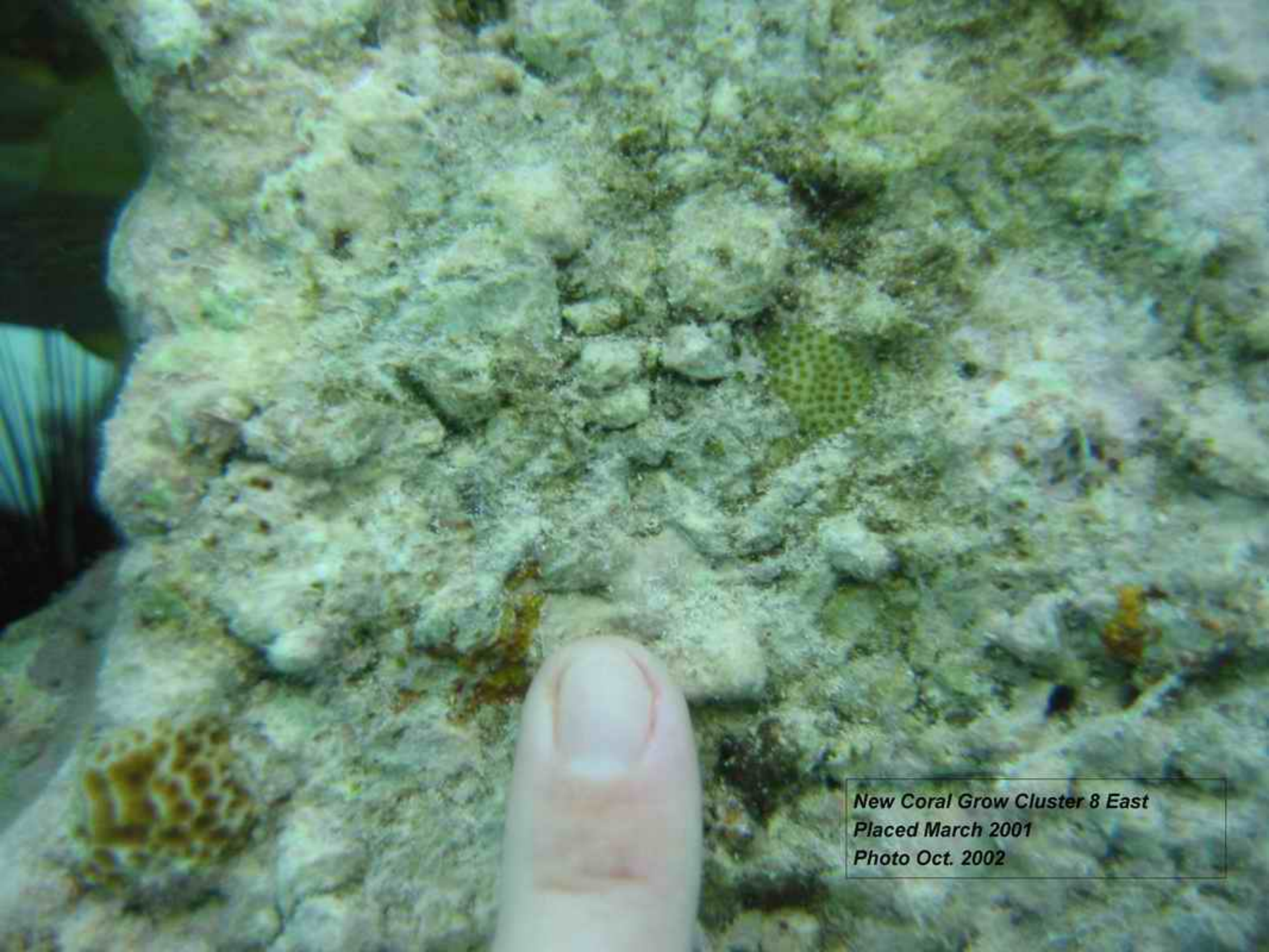
New Coral Grow Cluster 8 East Placed March 2001 Photo Oct. 2002