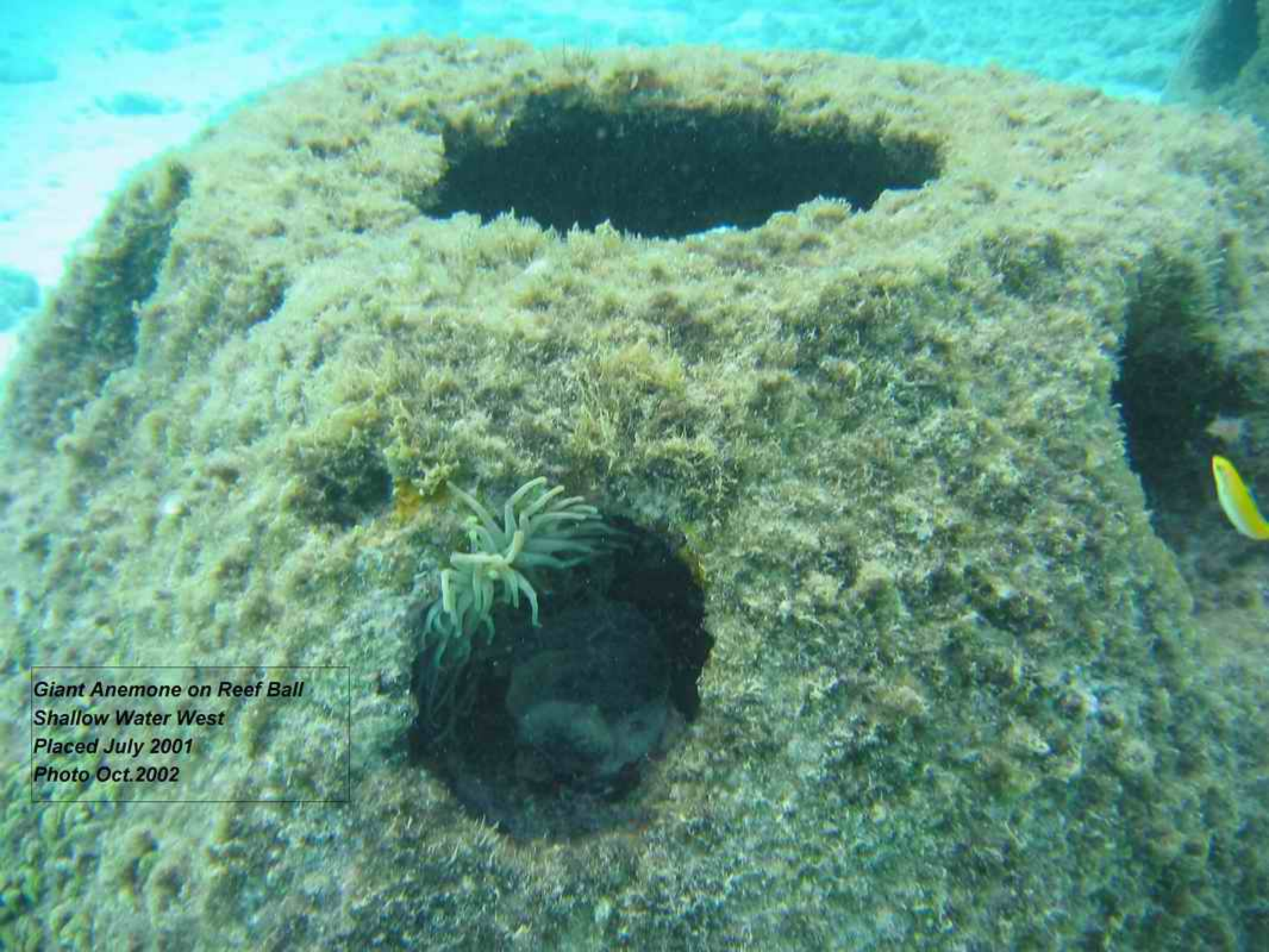
Giant Anemone on Reef Ball Shallow Water West Placed July 2001 Photo Oct.2002