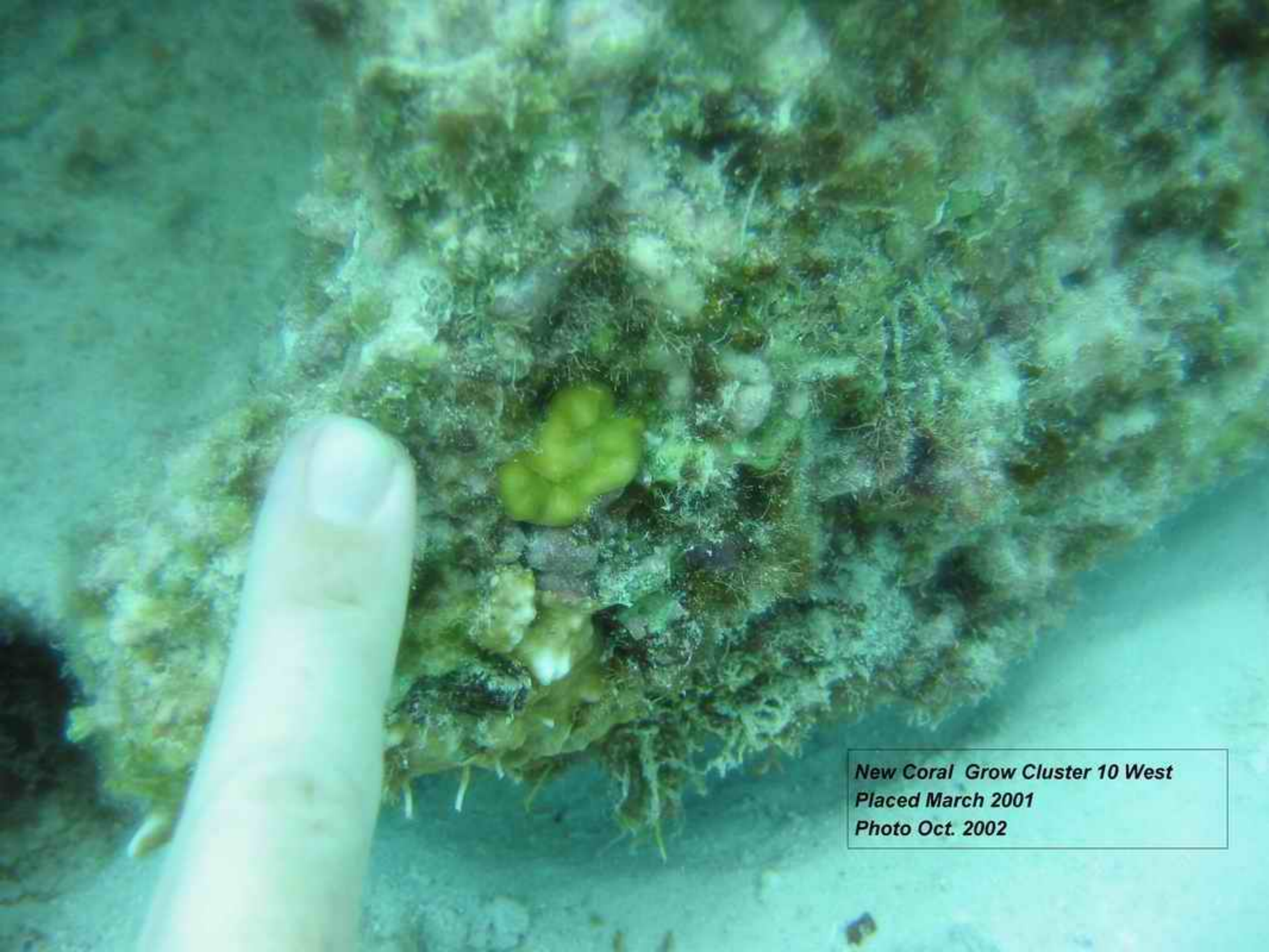
New Coral Grow Cluster 10 West Placed March 2001 Photo Oct. 2002