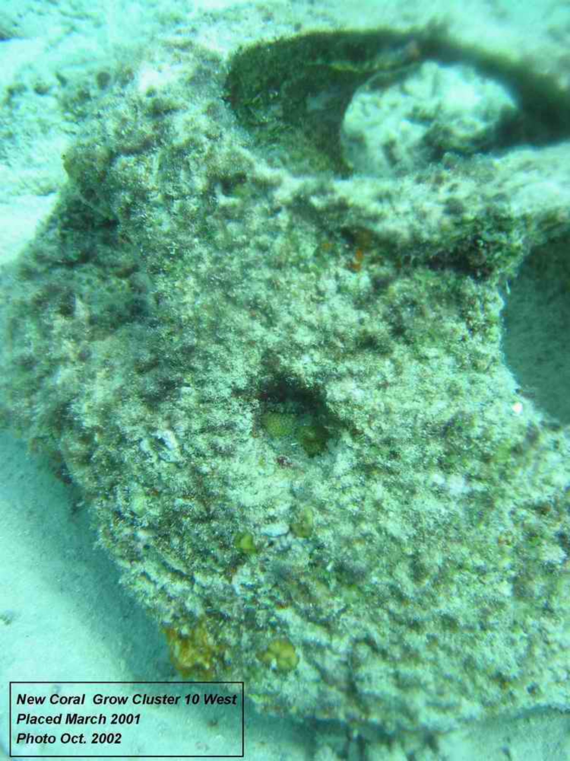
New Coral Grow Cluster 10 West Placed March 2001 Photo Oct. 2002