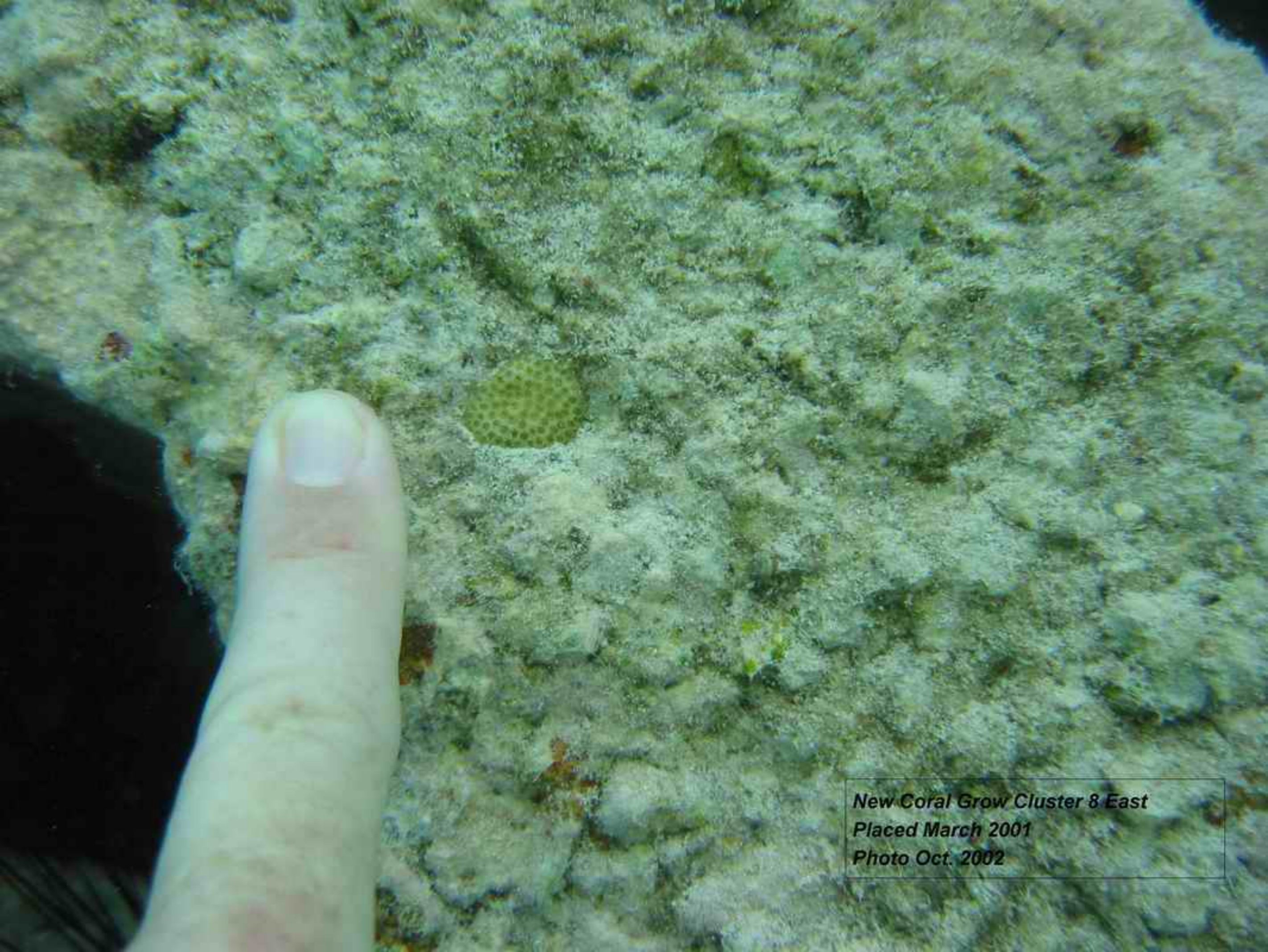
New Coral Grow Cluster 8 East Placed March 2001 Photo Oct. 2002