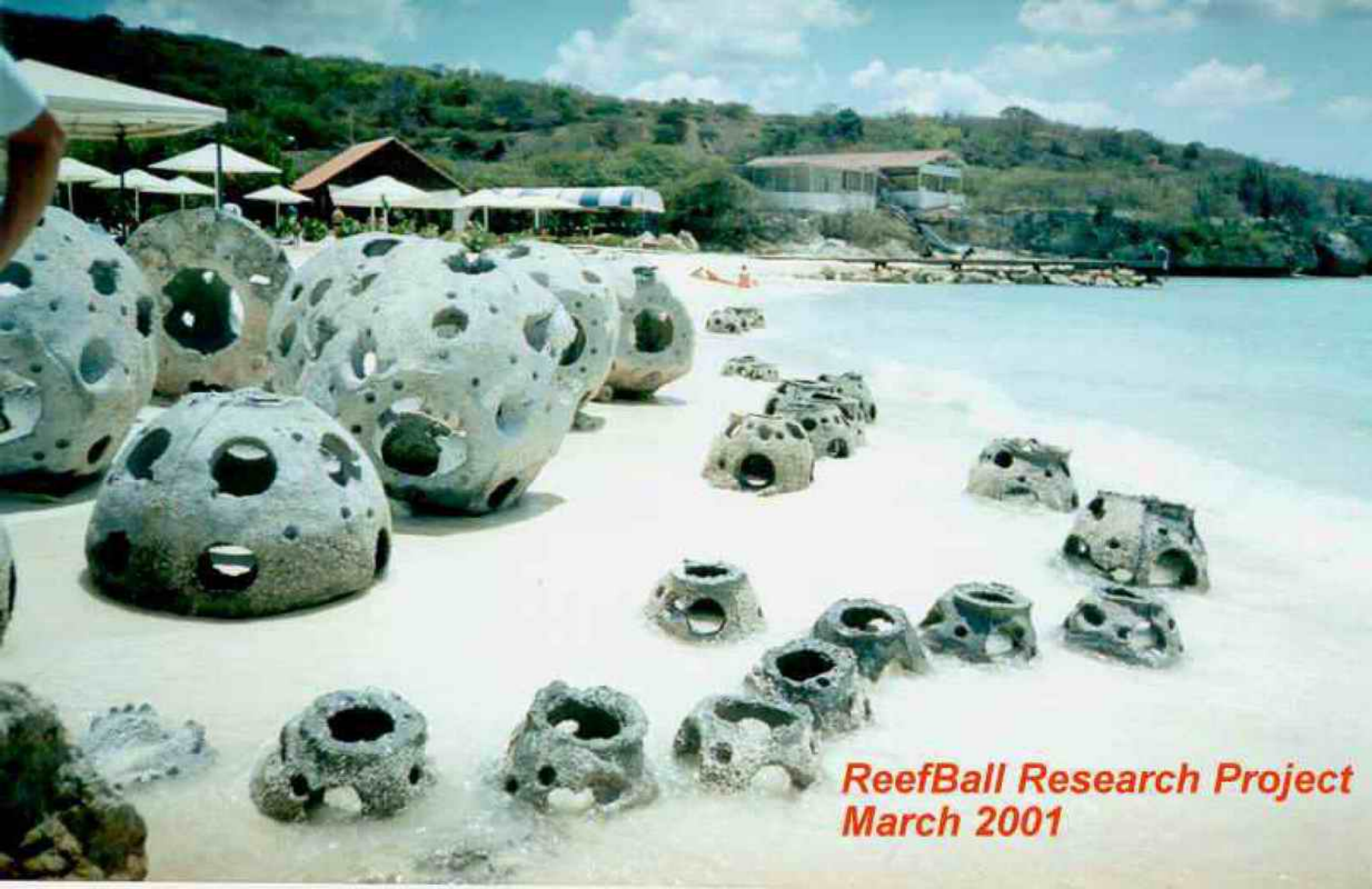
ReefBall Research Project March 2001