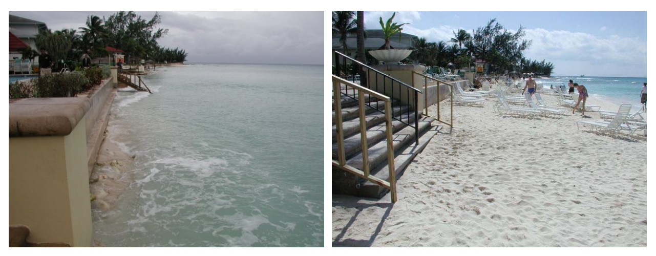
Figure 6. Before and After Breakwater Installation Photographs – View South October 2002 (left) and February 2003 (right)

Photographs of the beach in October 2002 (prior to completion of the Reef Ball breakwater) and February 2003 (3 months after the completion of the breakwater) are shown in Figures 4 and 5. As shown in these and newer photographs, the Reef Ball breakwater offshore of the Grand Cayman Marriott Beach Resort continues to maintain a wider and more stable beach than before.