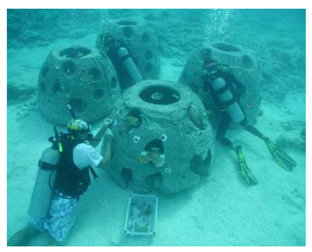
Figure 2. Reef Ball Foundation Volunteers planting Corals on Reef Ball Units.