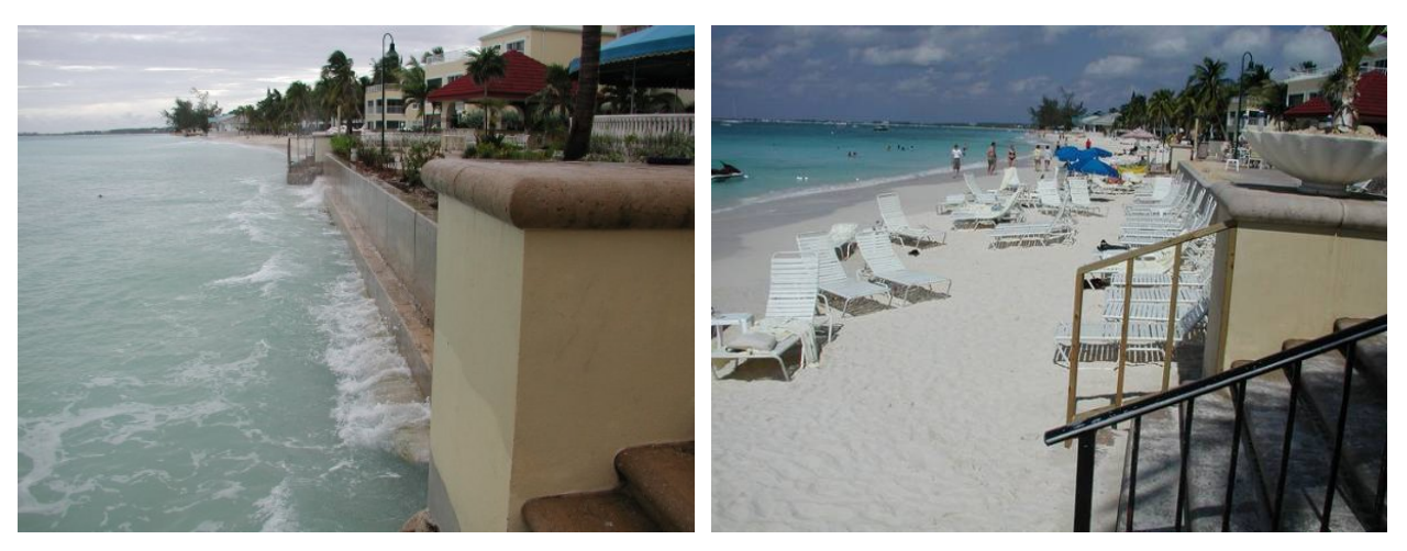
Figure 7. Before and After Breakwater Installation Photographs – View North October 2002 (left) and February 2003 (right)