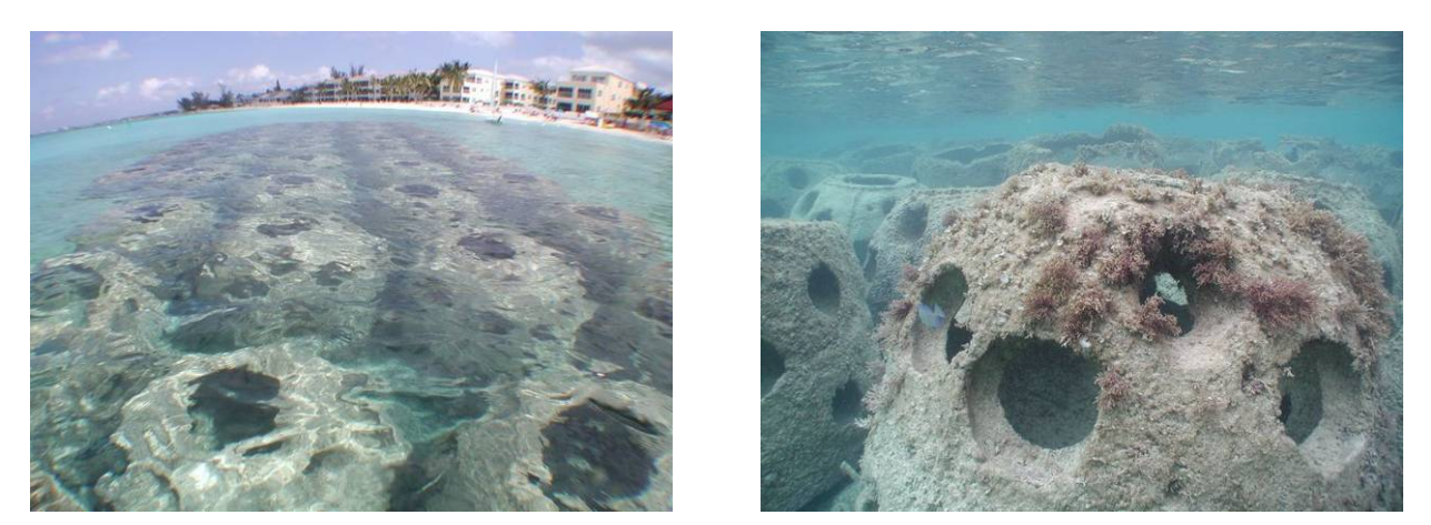
Figure 5. Grand Cayman Marriott Reef Ball Artificial Reef Submerged Breakwater -Above (left) and Underwater (right) Photographs.