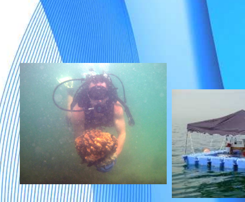
Photo and video documentation with relevant ID in frame is essential.

Our certified coral handler Mike Naugle relocating coral out of a dredge zone, Saudi Arabia. R: floating coral propagation station used to prepare coral fragments for transplanting (UAE).