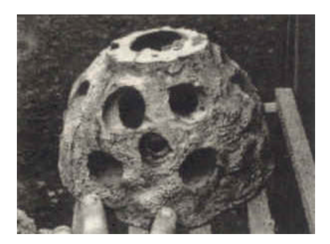
Reef Ball Models are 7 inches wide, 5 inches tall and weigh 5 to 6 pounds.

We started out making models of Reef Balls for Research & Development and as sales demonstration models. To our surprise, we took many orders for other uses. After two years of refinement, we have figured out a way to make them in large quantities even though every one is made by hand.