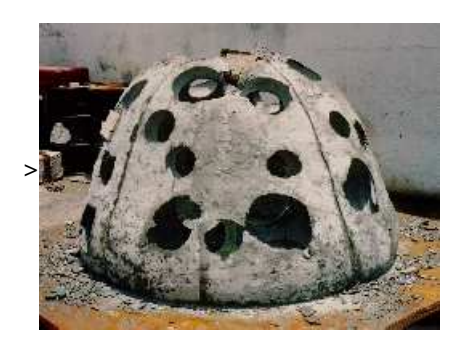
A Reef Ball is a Designed Artificial Reef used to restore ailing coral reefs and to create new fishing and scuba diving sites. Reef Balls are used for beach protection, freshwater, mitigation, and many other uses too. Reef Balls are the only artificial reef that can be floated and towed behind any size boat! Reef Balls are made of a special, marine friendly,

and conservation by providing technology, training and oversight to locals empowered to aid our oceanic ecosystems. To contact Todd Barber directly use reefball@reefball.com